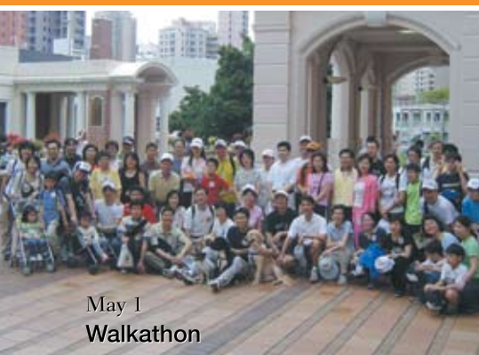
May 1 Walkathon